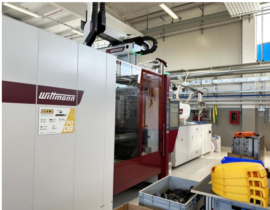
With clamping forces ranging from 60 to 700 tons, the machinery covers a wide range of applications.