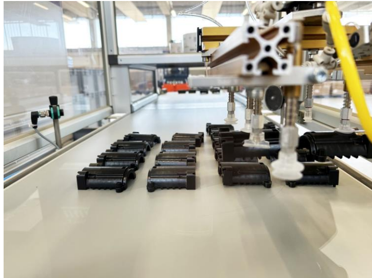
The handle pieces made of PC-ABS are produced in two halves inside a 2+2-cavity mold.