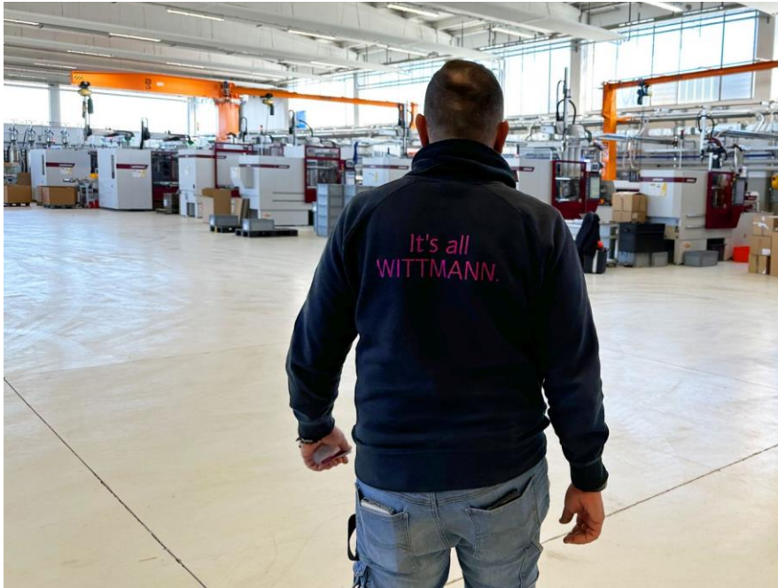
It's all WITTMANN. As a supplier of turnkey solutions, WITTMANN targeted high efficiency already at the planning stage as well as during commissioning.