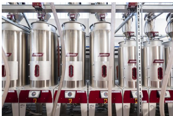
The central unit for drying and handling of the granulates supplies all of the eight injection molding machines with a wide range of materials.