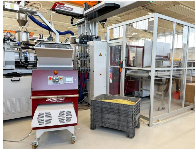
Sprue and reject parts are reground directly next to the machine. For many products, the granulate can be blended in with the virgin raw material.